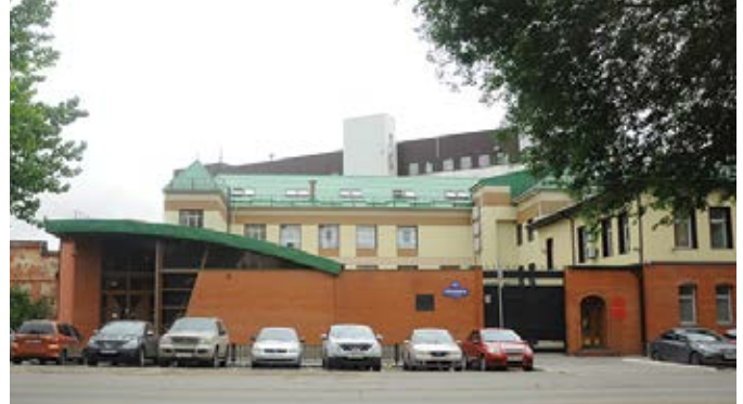
108 Rabinovicha St., Omsk, Russia

We carry out works on the systems implementation on a "turnkey" basis, namely, design and survey works, design development, industrial safety expertise of design documentation and equipment. The company employees perform construction and installation, wiring and commissioning works, the Customer's personnel training and certification in the COMPACS System operation, the systems warranty and post-warranty service.