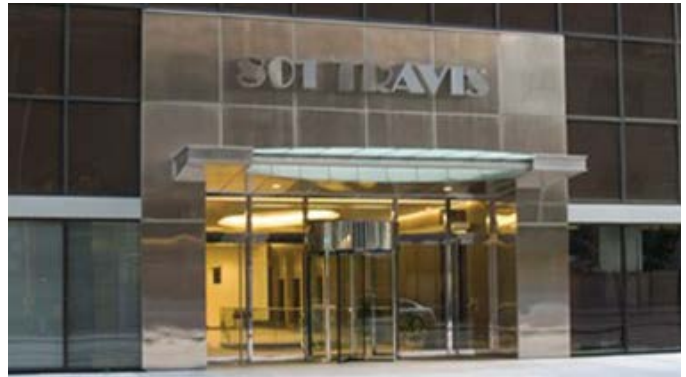
801 Travis, Suite 2025, Houston, Texas

Our Systems and Technology have changed refining in Russia and CIS countries by dramatically decreasing operational risk and increasing the safety and operational efficiency of processing in the refining industry.