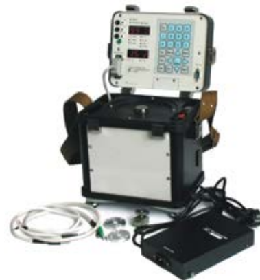
8003 Universal calibrator

Our Metrological Service is accredited by the Federal Agency for Technical Regulation and Metrology to verify and calibrate measuring instruments, and is made up of certified calibration technicians.